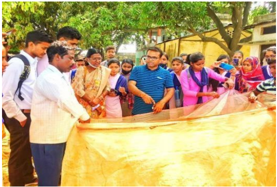
Visit of Fish Pond of Lala Nagar, Bhadohi for B.Sc. II and III students on 15th March 2021