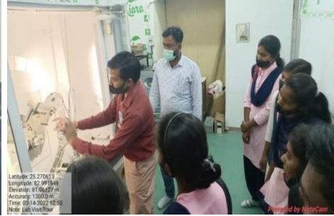
Hydrogen Energy Centre & Solid State Physics Laboratory, Department of Physics, BHU, Varanasi