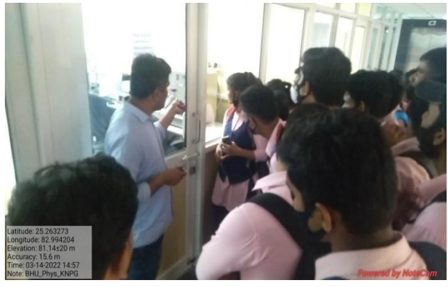
Atal Bihari Vajpayee Science Discovery Centre, BHU, Varanasi