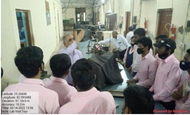
Laser and Spectroscopy Laboratory, Department of Physics, BHU, Varanasi